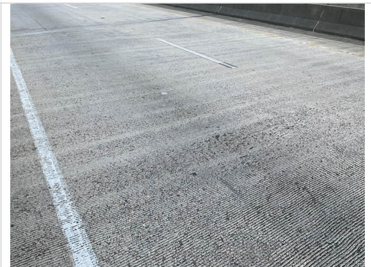
Span 2: multiple unsealed transverse and longitudinal cracking.