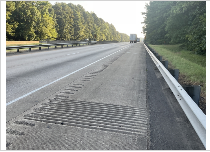
Inventory looking east